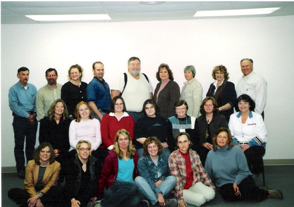
Participants of the In-depth Grant Writing Course