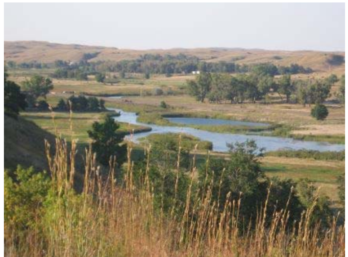
This photo of the Middle Loup River valley west of Theford was adopted as the primary photo of Sandhills Journey Scenic Byway.

Explore Nebraska Highway 2, the Sandhills Journey Scenic Byway. You'll leave with an immediate desire to return, a sense of rejuvenation and the comforting feeling of knowing that there is still a wild place in the world right in the heart of Nebraska.