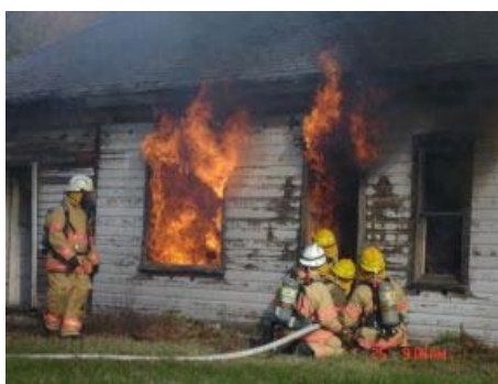
Mullen Rural Fire Protection District conducted a training near Seneca for volunteers on structural fires .

The extrication equipment that is currently available is greater than 10 years old and some is older than 20 years. The project plan included refurbishing three older Holmatro hydraulic tools and a pump that can be modified at about 25% of the cost of new items. The District plans to purchase one new Holmatro combi-tool and a new pump unit that can operate two hydraulic tools at the same time. In addition, the District will add to their equipment inventory with new cribbing and stabilizer jacks to aid in extrication activities.