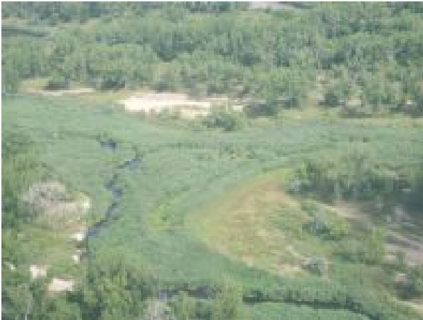
Monoculture stands of Phragmites degrading habitat and 'choking' river flows.

During the fall of 2008, a total of 2,694 acres of the invasive Phragmites were treated on the Platte Rivers in Lincoln County by North Star Helicopters. This completed treatment on the first three project priority areas that were designated earlier in the year. The helicopters in the area also lead to great publicity for the West Central Weed Management Area. KNOP-TV ran footage and interviews during the beginning of the application process. The North Platte Telegraph, Omaha World-Herald, and Kearney Hub all ran stories about this project and Platte Valley Weed Management Area's project that occurred in south central Nebraska as well. This publicity ran across the state making more Nebraskans aware of the problems within the Platte River.