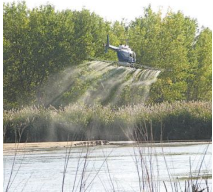
During the fall of 2008, a total of 2,694 acres of the invasive Phragmites were treated on the Platte Rivers in Lincoln County

The Platte River of Nebraska is known for its wildlife habitat and for a diverse range of flora and fauna. Within the Platte River, an invasive species called Phragmites has out-competed native vegetation by reducing biodiversity. This plant is an aggressive invader and