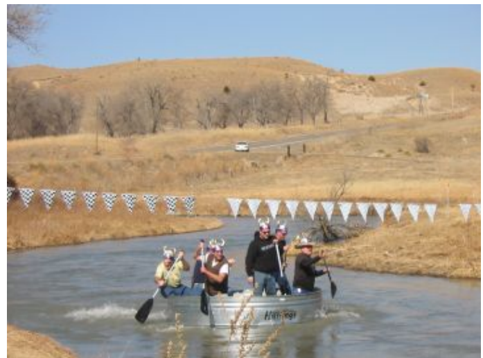
The first Polar Bear Tank Race was held in February 2008 as a collaborative event with Hooker and Thomas Counties.

Assistance is being provided to Hooker County Lodging Committee to carry out tourism activities. These include responding to information requests, website development, advertising campaign development, and local tourism events.