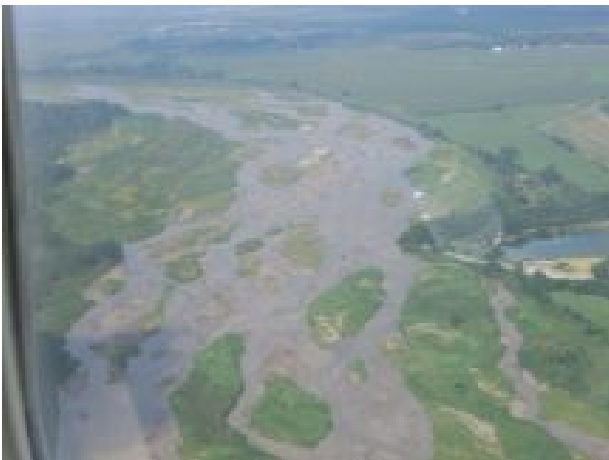
Goal of the Project would result in more native Platte River habitat – above is a current picture taken in Hall County on treated and managed lands. (2008)

The project will use a regional watershed approach encompassing the North Platte River from Kingsley Dam and the South Platte from the Colorado state line through the Platte River system down to the